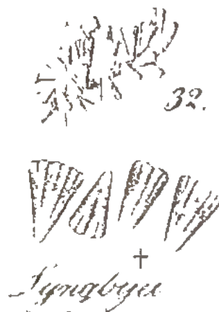
Fig 1. Original illustration of Frustulia lyngbyei Kützing (1834: pl. 14: fig. 32), based on the type of Licmophora juergensii C.Agardh (1831).