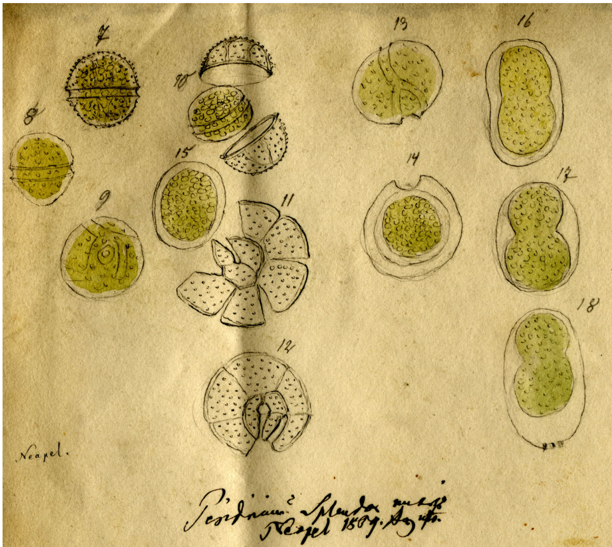
Fig. 5. BHUPM 957. C.G. Ehrenberg's drawing of "Peridinium? Splendor maris" as basis of the published copper-plate engraving.

The specimens Ehrenberg had to hand when publishing Peridinium splendor-maris give more precise information (e.g. the small plate 6" in Fig. 3) on the identity of Ehrenberg's taxon than the drawing (Fig. 5). The line-drawings were misidentified as Lingulodinium polyedra (F.Stein) J.D.Dodge ( \equiv Gonyaulax polyedra F.Stein) by some later authors (see Carbonell-Moore 2018). Ehrenberg documents a monospecific bloom of a dinoflagellate, which is clearly a species of the genus Alexandrium subgenus Gessnerium , except for some cells of Prorocentrum lima (Ehrenberg) F.Stein. This is the first documented bloom of an Alexandrium species, based on deposited preparations (Figs 1-4). The species described by Ehrenberg as Peridinium splendor-maris , for which he later created the genus Blepharocysta , is very similar or even identical to the species now known as Alexandrium balechii (Steidinger) Balech ( \equiv Gonyaulax balechii Steidinger). Blooms of Alexandrium balechii were described from this region some 120 years later by Montresor et al. (1990). For taxonomic clarity it would be useful to epitypify Peridinium splendor-maris and Alexandrium balechii from their respective type localities, including molecular sequences and deposited preparations made of clonal cultures.